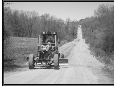
Work on Purdy Road.