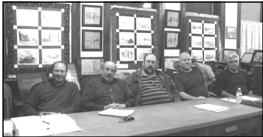
Town of Hume Town Board