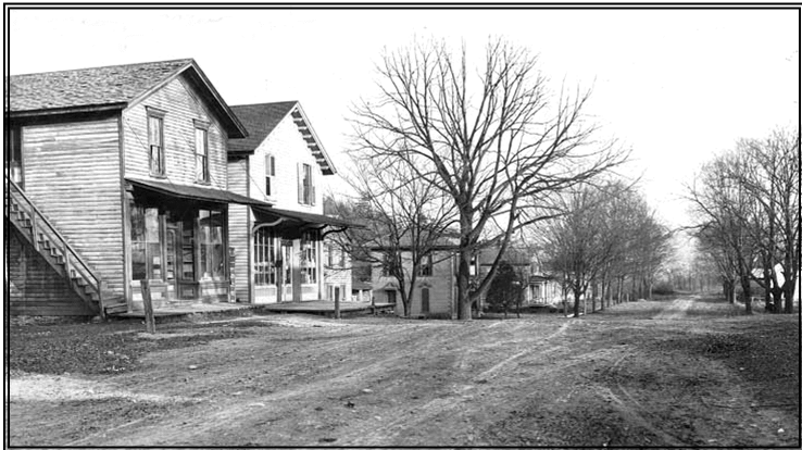
Scenes from the old days. Do you know where and when?