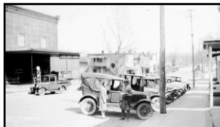
Hardware circa 1930, note gasoline pumps in front of store.