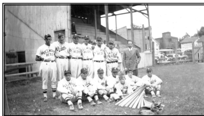
Fillmore Reds below