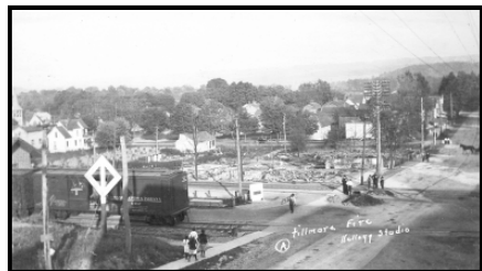
West Main looking east after 1916 fire.

On September 6, 1916 a devastating fire swept down the north side of West Main Street in Fillmore. Destroying the entire block from the Railroad House to the corner of Minard Street. The fire destroyed over ten businesses, barns and smaller buildings.