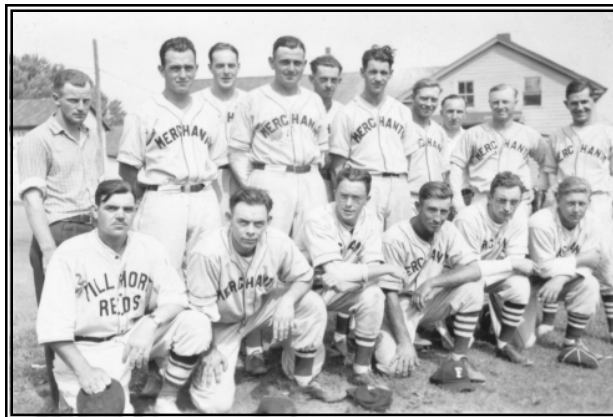
Fillmore Merchants & Reds above

Pictured at the right are two of Fillmore's Baseball Teams, can you name any of the players? It would be nice to know who these great ball players were. For a closer look at the photos visit the Town of Hume Museum.